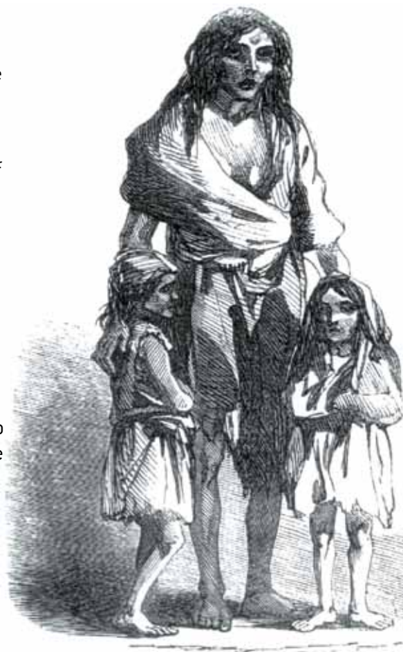
Illustration showing a family during the Famine

On the other hand, Nationalists reaped benefits from the United Kingdom becoming increasingly democratic in the second half of the nineteenth century. Growing prosperity allowed more Catholics to have their children