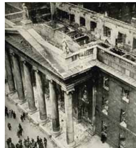
GPO Dublin Easter 1916

The appalling sectarian violence suffered in Belfast in 1920 and 1921 was echoed in Derry. In June 1920 the UVF in Londonderry launched an attack on Catholic residents in the Bogside. The Derry Journal reported