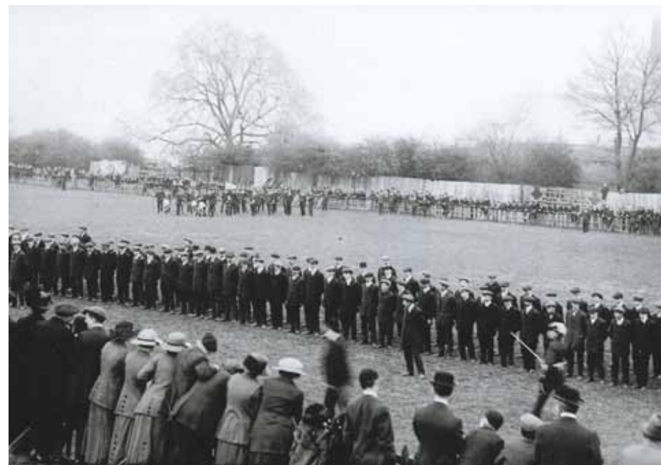
Irish Volunteers in Derry

About a quarter of the Ulster Volunteer Force volunteered for service in the Great War. They formed the core of the 36th (Ulster) Division. The 10th Royal Inniskilling Fusiliers, part of the 36th Division, were commonly known as 'The Derries' because many of them used to be members of the City of Derry and the County Derry divisions of the UVF.