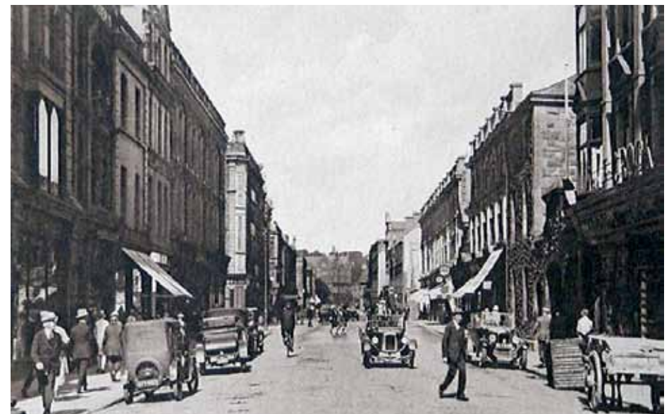
Strand Road Derry~Londonderry 1920

Life in Derry~Londonderry after the formation of Northern Ireland in 1921 was blighted by tense divisions between its Nationalist and Unionist populations. Unionists in Londonderry felt very much under siege, both from the growing